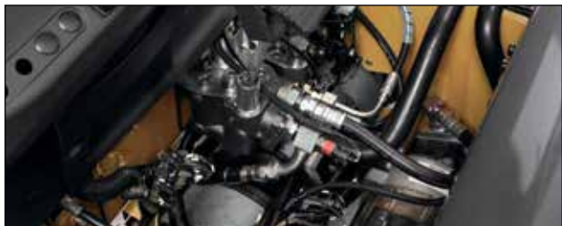
Factory warranty for added protection